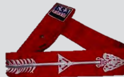
BSA 100th Commemorative Sash