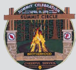
6" Summit Circle Dedication Patch, April 2016