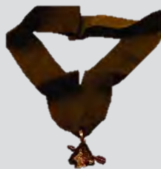
Green DSA Awarded prior to 1965