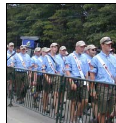
The OA Service Corps