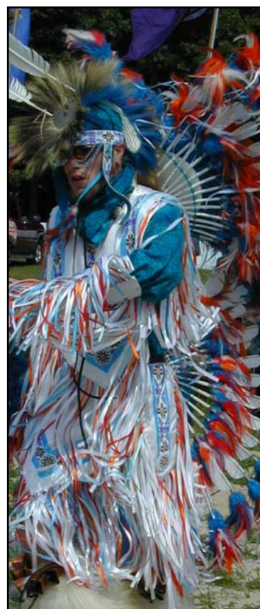
The OA Indian Village

required to support the Mysterium Compass. Some of these roles include game managers, ushers, audio-video and lighting crew members, stage managers, special effects staff and people to build and manage the background scenery for the program.