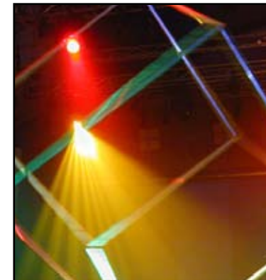
The Mysterium Compass