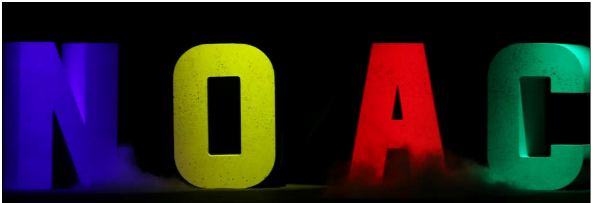
The opening show at the 2009 National Order of the Arrow Conference.