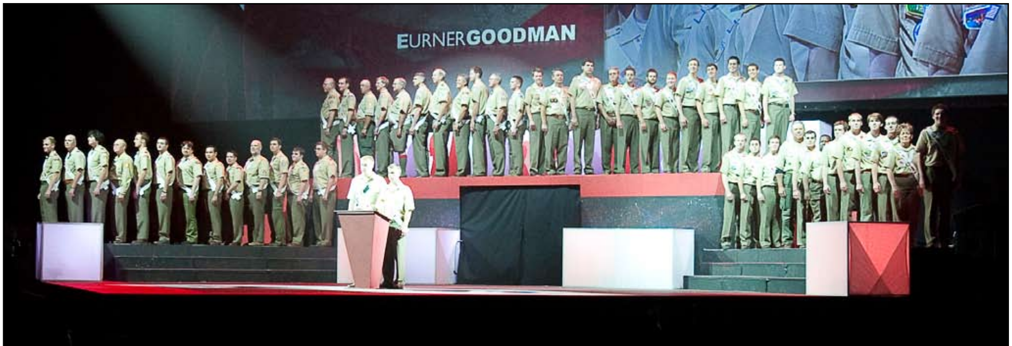
The Class of 2009 at the Sunday evening show at the 2009 National Order of the Arrow Conference.