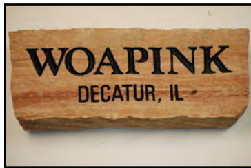
Woapink Lodge Legacy Rock

As we continue this historic journey leading up to the Order of the Arrow's 100th anniversary in 2015, it is time to review lodge's status on each milestone of the Legacy Project. It is an exciting time to be a member of the Order of the Arrow, and all Arrowmen have a unique opportunity to get engaged with the OA centennial today!