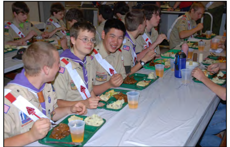
Arrowmen enjoying their meal at the Noquet Lodge Fall Fellowship

Donations from lodges and individuals are still coming in. Additionally, these unique patches are flying out the door every day. The response from the OA and Scouting has been great, but the need in the Philippines is even greater. Though the relief will take many years, countless man hours and billions of dollars, it will be shortened by the thousands of Scouts and Arrowmen doing their good turn through their donations and cheerful service to help rebuild devastated communities.