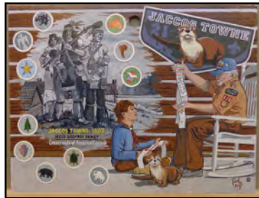
Jaccos Town Lodge Legacy Lid

Once your lid is complete, please take a high resolution color photo or make a high resolution scan of the lid. Please upload the image to the link found at the end of this article. Images should be in JPG format