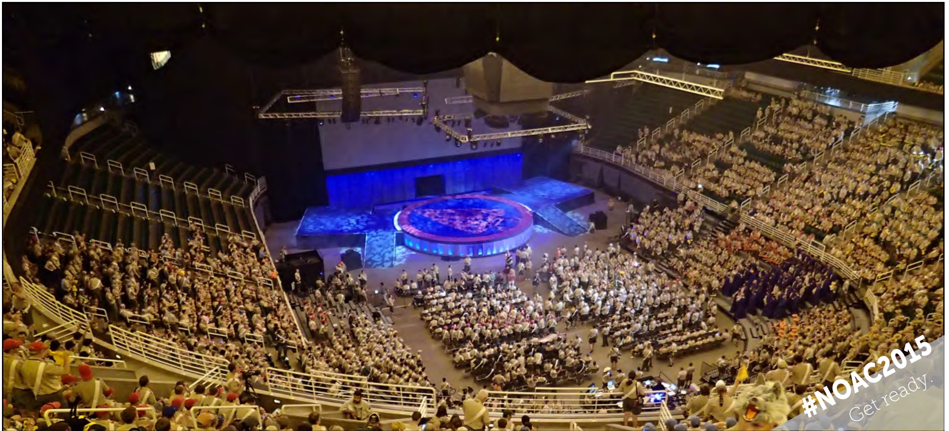
Arrowmen gathered for the opening show of NOAC 2012